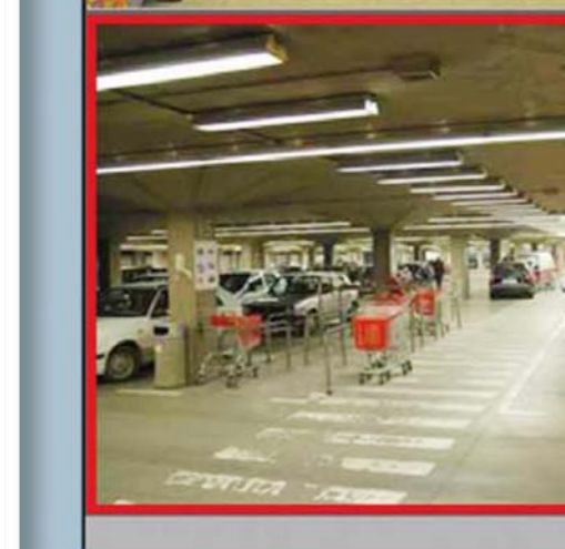
Server Shopping Mall Supermarket